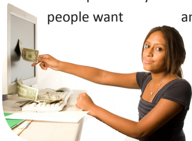
Learning that produces value.

Another word for value is 'profit.' It is a simple fact of life that work that is of value profits. When teenagers produce work that people value, a sentiment expressed by purchasing that work, they themselves learn self-respect. They can do something that people want and need.